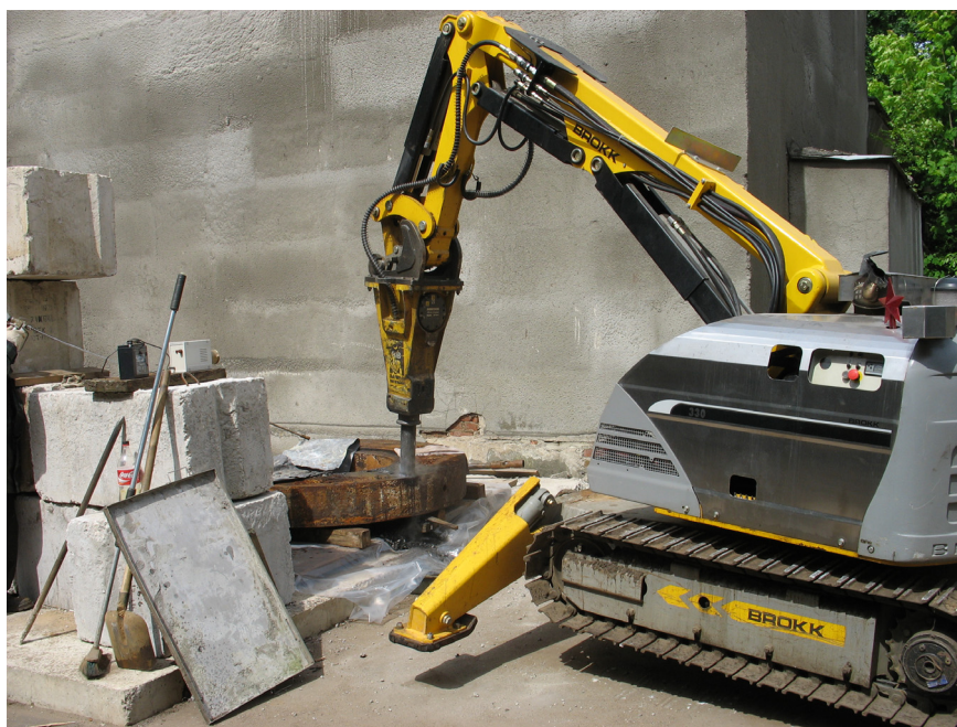
Fig. 2. Destruction of a semi-ring by Brokk-330 hydraulic hammer